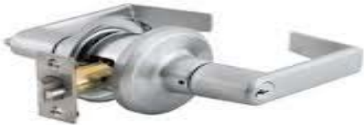
Hallway side view