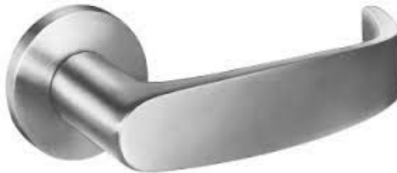
Classroom side view