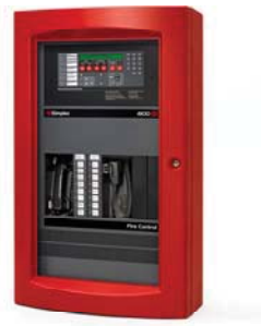
Simplex 4100ES Fire Alarm Control panel